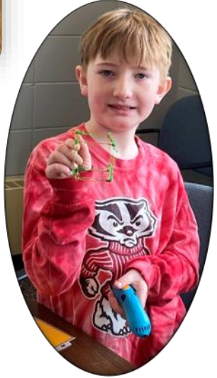
DOODLE IN 3D