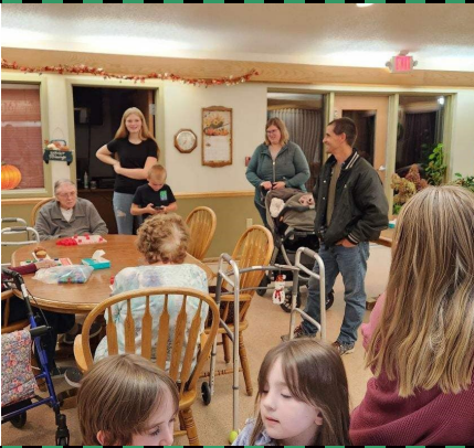
Restless Rascals playing Bingo at Regency House As- sisted Living with the residents