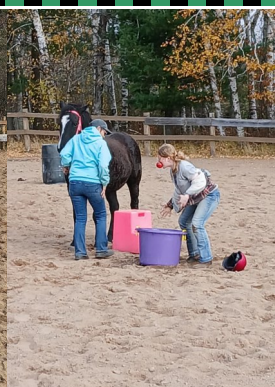
Horse Council Horsing Around for Halloween