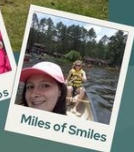
Miles of Smiles