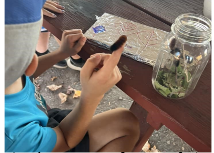
Flambeau 4—Leafers Tin foil rubbings and woolly bear caterpillars show and tell