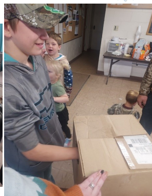
Happy Hoboes making a pie in a cup and playing Halloween edition of What's in the box