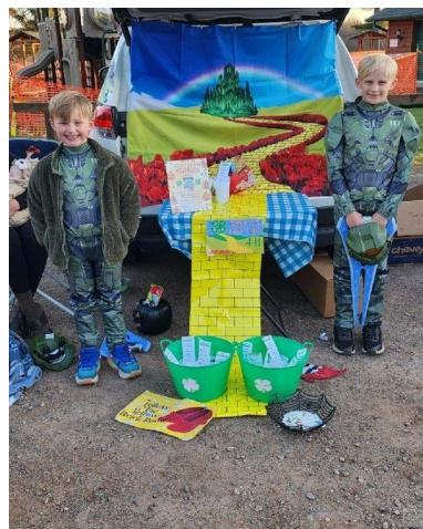
Hillbillies passing out candy and 4-H flyers at Ogema Trunk or Treat with their Wizard of Oz theme trunk!