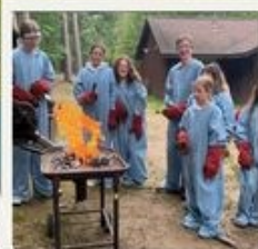
Three Days of Independence